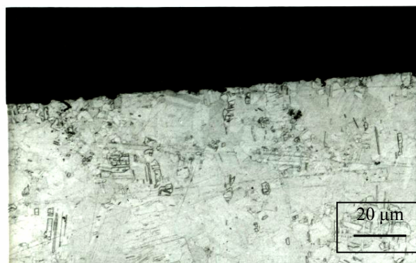
Figure 3. Pitting corrosion and microstructure of the cross-sectional electrode (CuZn20Al2.00 alloy) after measurement of the anodic potentiodynamic polarization curve in natural seawater; magnification: 200x

Figure 3 showed cross-section of the condenser tube CuZn20Al2.00 alloy obtained after measurement of an anodic potentiodynamic polarization curve in stagnant aerated natural seawater. In this condition on Al-brass the pitting corrosion was occurred. The black pits occurred on Al-brass surface indicates that the natural cooling seawater was polluted with sulphides.