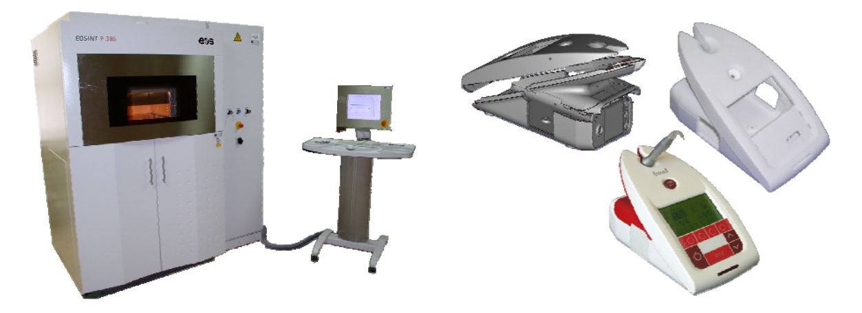
Figure 3. RM product and EOS PA 2200 machine

P385 RM machine and a sintered product are presented in figure 3 . Dimension of the machine chamber is 340x340x620 mm, and dimension of the housing is 106x186x110 mm. At one chamber it is possible to make simultaneously 15 completes of housing; with manufacturing time of 42 hours for 15 products, all the customers demand related to the quantity, price, quality and flexibility are fulfilled. Therefore we can state that we are presenting a case of Rapid Manufacturing of final products.