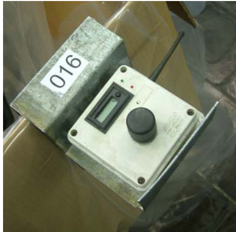
Figure 7 The final push – button module