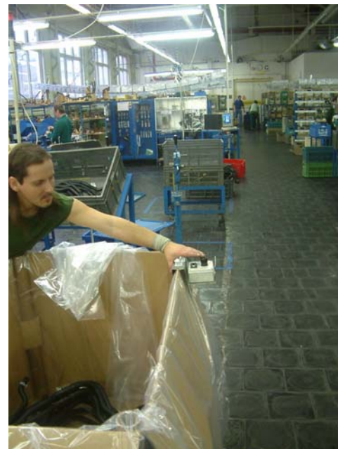
Figure 7. The workplace with the push – button module