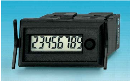
Figure 1. The digital counter

The electronic of the push – button module should be simplest and cheap because the wireless system contains more push – button modules. A purpose of the module is to evaluate pressing of the button. A value displayed on LCD must correspond to actual number of pressing, same value must be saved in database ORACLE.