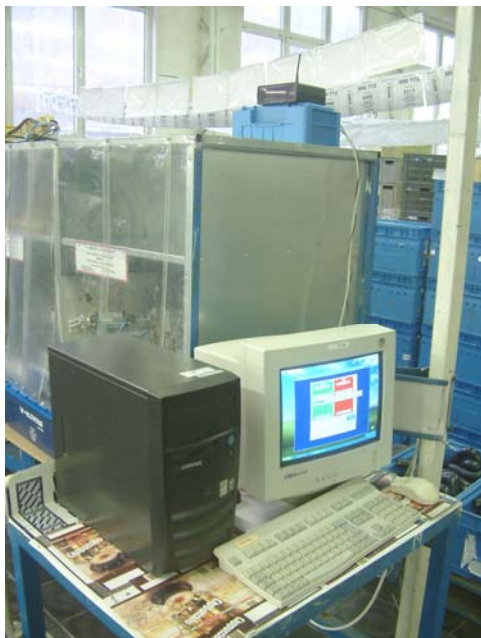
Figure 6. Workstation with the receiver

The parameters of the push – button module and the parameters of the receiver are shown in Tab. 2 and Tab. 3. A reach of the radio signal in mentioned system is 100m in free space. The designed system was implemented for working achievement control in the british corporation AVON Robber p.l.c. The examples of implementation in plant are shown in Fig.6 – 7.