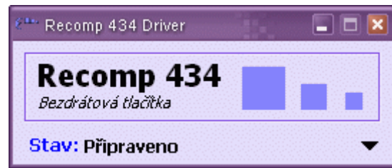
Figure 5. The status panel of the downloader