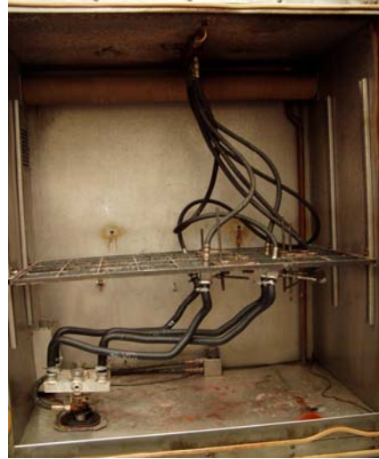
Figure 2. Test chamber and tube samples

Second ends of tube samples are mounted to a supporting grid of chamber and are connected to steel tubes which transfer liquid to an output cube. Secondary circuit is parallel connected to a closed circuit of liquid. The hydraulic system provides required pressure in tubes. The hydraulic system consists of primary and secondary circuits. A source of pressure is a hydraulic unit. The primary circuit consists of a proportional valve, main and auxiliary hydraulic cylinder. The pressure is set up by main hydraulic cylinder (piston) which compresses the liquid. Position of the piston and consequently value of the pressure are set up by the auxiliary cylinder (piston). The aim of control is manipulating of this auxiliary piston by speed of inflow and outflow of oil in the cylinder. This is performed by a proportional valve Rexroth 4WRA6 which is controlled by current signal.