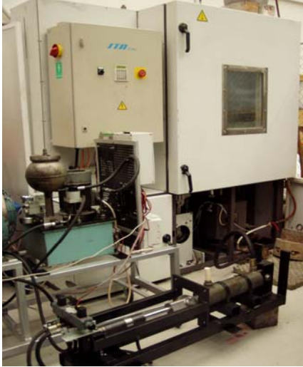
Figure 1. The test room