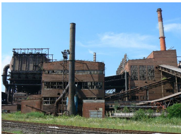
Figure 1. Sinter plant of Steelwork Zenica

Modern blast furnaces achieve improved performance by prior physical and metallurgical preparation of the burden which improves permeability and reducibility. This preparation entails agglomerating the furnace charge by sintering process. A number of chemical and metallurgical reactions take place during the sintering process. These produce both the sinter itself, and also dust and gaseous emissions. Steelwork Zenica, BiH, has been in existence for more than 115 years. Steelwork Zenica produced nearly 1,9 Mt/a of sinter - state 1990.; today it produces 1,2 Mt/a of sinter, a key ingredient in the feed for the blast furnace process.