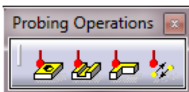
Figure 1. CATIA probing operations toolbar

One of the most powerful CAM software is CATIA, produced by Dassault. Manufacturing modules of CATIA are improved by additional probing options. In this case are possible to use a hole ore pin probing cycles, slot or rib probing cycles, corner probing and multipoint probing. This options gives possibility to define basic measurements cycles. To do it is necessary to define geometrical information, it is done by clicking on the 3D model. For example to measure hole it is necessary to set center point of holes (by point or circle selection), measured body, and top surface. Geometry of measuring tool can be taken from catalog or defined by user if necessary. Most important is to