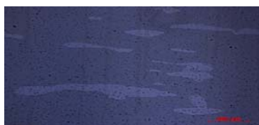
Figure 21 The microstructure photo of the cross section tank without heat treatment (200X)

For microstructural investigations samples are taken from 4 different sections of each tank. The sections are exterior surface, interior surface, straight sections in longitudinal direction and neck of the tank. Microstructures of prepared samples were examined under optical microscope. Grain growth, directed grains and the different phase structures were observed in this study. The 200 times enlarged photo of the tank which is made of Al 6063 alloy, not subjected to heat treatment but subjected to hot and cold deformation and it is shown in Figure 2.