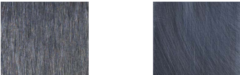
Figure 3. Magnified photographs (4x) of sample 2344-101: a) ground sample, b) polished sample

In Figure 3 the magnified pictures (4x) of sample 2344-101 are presented: