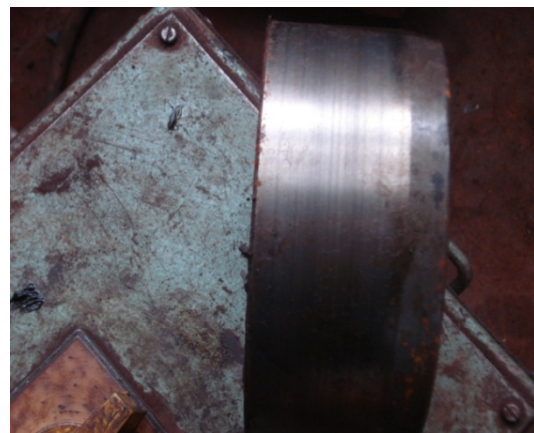
Figure 2. Damage deposit (sleeve), corrosion and etching Figure 3. The damaged surface and flaking