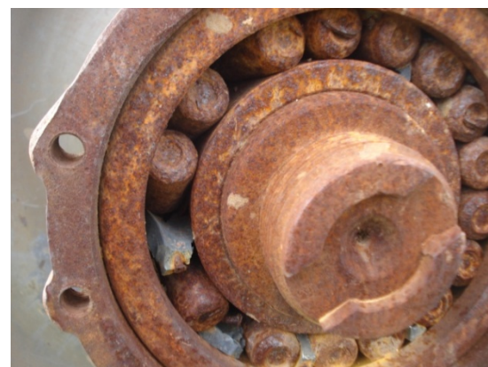
Figure 4. Cracks in the ring