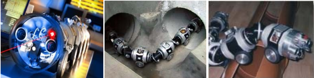
Figure 2. Robot MARKO plus for pipeline inspection [10]

Another robot for testing pipelines is MACRO plus robot. This service robots have remarkable mobility and it moves like a snake through the pipes with its flexible body. Segments of the body contain two batteries for power supply, computer, two heads and two symmetrically placed ports for operational elements. Computer allows the robot to move autonomously. Ball joint has three degrees of freedom and is located between the drive unit. Highly integrated electronics uses a digital signal processor that controls the motor and gives accurate calculations of angles Service robot MARKO is shown on Figure 2.