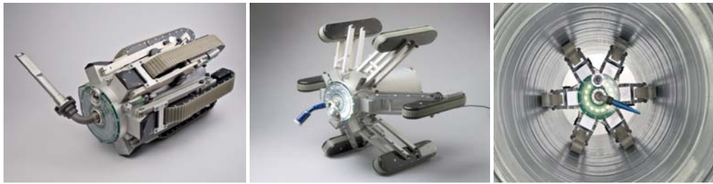
Figure 3. Service robot Jetty [10]

Figure 3 shows service robot in the open position. The robot can clean not only horizontal channels, but vertical and angled channels, as well as in the form of the letter S. The robot is equipped with a camera. Monitoring the inspection process and cleaning is done by using a computer display. Control of the robot is done by Jetty joystick.