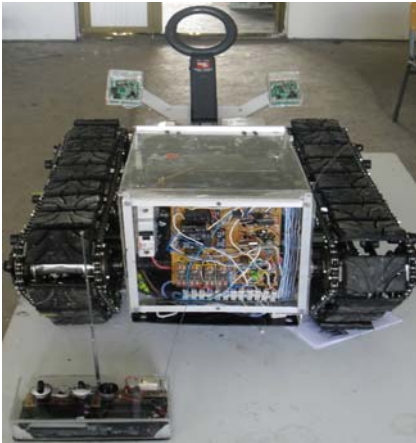
Figure 1. RoboDet