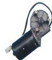
Figure 6. DC motor

In any motor, torque is the result of the force between two magnetic fields and is proportional to the amount of current flowing through the motor.