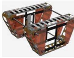
Figure 2. Skeleton