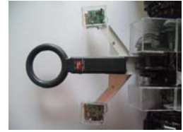
Figure 3. ‘Moving hand’ set