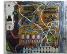
Figure 4. Control electronics (Receiver and Transmitter)

In the figure 5 ., the basic directions of device’s movements and while ‘moving hand’ move realized by the communication between the transmitter and the receiver circuit for the control motion.