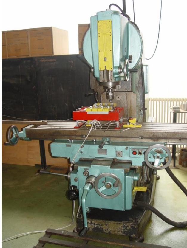
Figure 4. Vertical milling machine used in FSW method.

Figure 5 presents the welded workpieces on the upper side or the side from which the welding is performed.