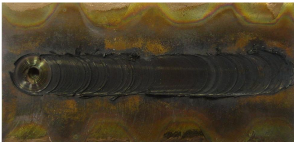
Figure 5. The appearance of the welded joint with the upper side of the welded workpieces

Figure 5 presents the welded workpieces on the upper side or the side from which the welding is performed.