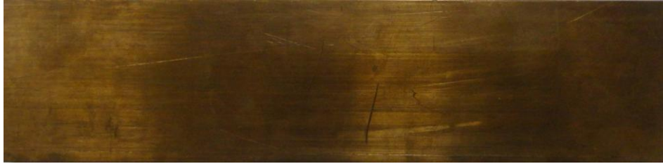
Figure 3. Macrostructure of copper alloy.