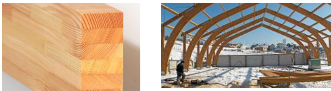
Figure 1. Glued laminated beams obtained through thickness bonding of wood sections

In accordance with EN 386, the maximum permissible moisture of sections that will be bonded is 15 % in the workspace temperature of about 20 °C (minimum 18 °C). Quality control is carried out in accordance with EN 385 and/or EN 14090 or other standards relating to the quality of thickness gluing.