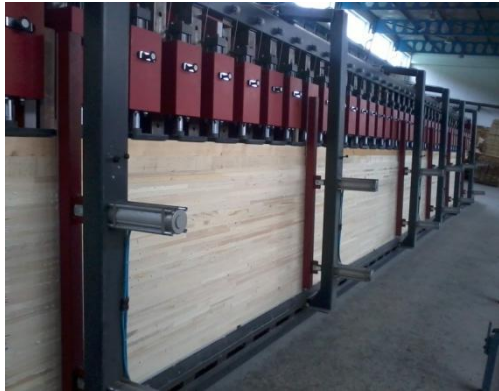
Figure 2. Cold press SORMEC 2000 S.r.l.

According to standard EN 393 was done an adequate testing procedure for examination of the shear strength with proper positioning and clamping of samples to the measuring device and exposure to the power with certain intensity that leads to the destruction of the glued joint between adjacent sections. Testing of the shear strength was done using testing machine ZWICK (Figure 3).