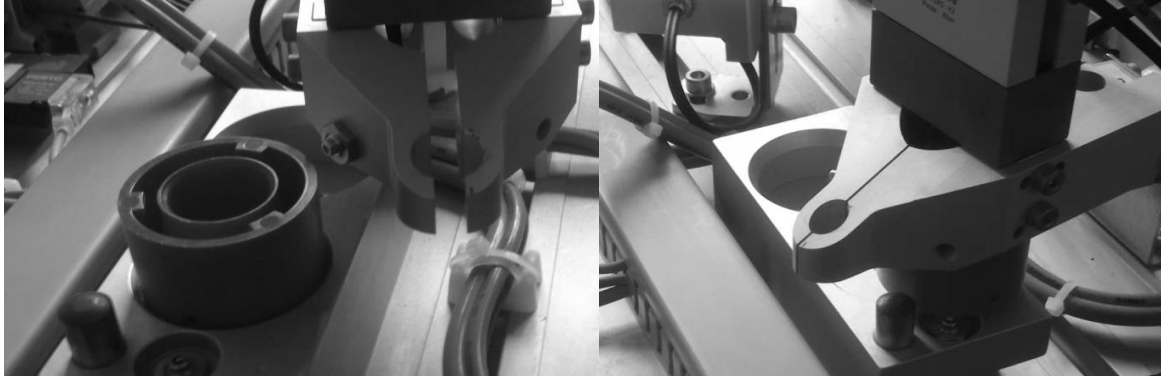
Figure 1. Colour detection

colours, and since in this exercise work pieces are black and red, they will be sorted. IF...THEN...ELSE as a branching command provides subprogram choose depending on signal state from sensor COLOUR. If the signal is 1 (sensor active), the subprogram *RED will be called, and subprogram *BLACK otherwise. The subprogram sequences are same in both subprograms, but since the height of black and red pieces is different, there is necessary to record different positions for further program execution, so there are two subprograms.