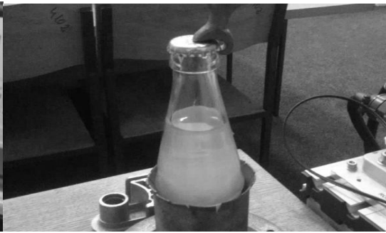
Figure 5. Bottle opening

From this position is lowered by half millimetre in Z-axis direction using WHILE command. The end effector will lower until sensor COLOUR placed on end effector activation. In the moment of sensor activation end effector is stopped and its current position is stored as P6 position. Sensor would be activated when it gets to the top of the bottle and so defined position will be used for defining of positions for bottle opening.