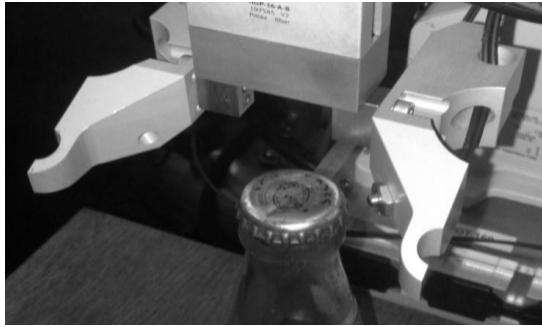
Figure 4. Bottle height detection