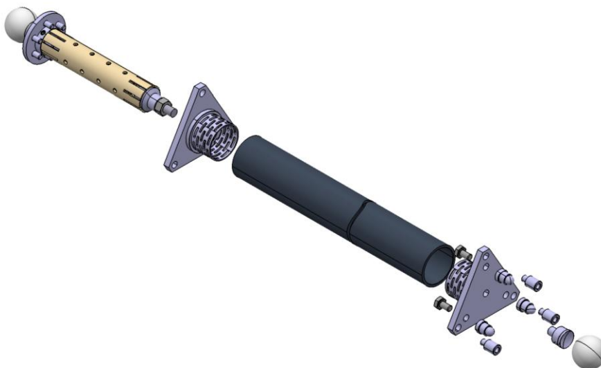
Figure 2. Design of modules 1 and 2

Detailed design of modules 1 and 2 is shown in Figure 2.