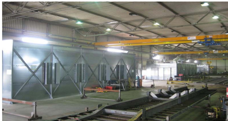
Figure 1. Department for surface protection in the company BME

The process of surface protection in the company BME is done in three cabins. As shown in figure 1, the first cabin is used for sand blasting, the second cabin for basic painting and the third cabin for final painting.