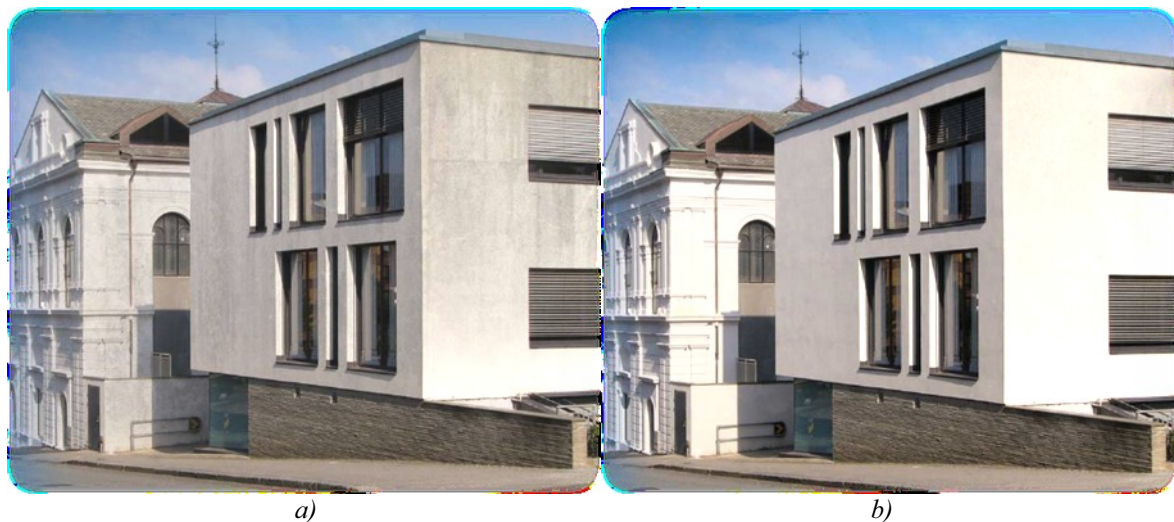
Figure 3. Ordinary concrete building (a) and self-cleaning concrete building (b) [11]

Figure 3 shows the difference between ordinary concrete building and self-cleaning concrete building [11].