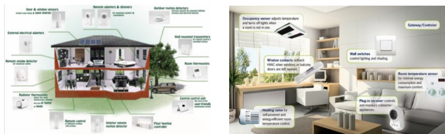
Figure 3. Smart home

The smart home system monitors and manages all systems, devices and home installations in real-time, in a way that is consistent with users' requirements, needs and habits, saving energy, while enhancing the comfort of life and security. This home automation system can include centralized control of lighting, heating, ventilation, air conditioning, various appliances, security door locks and other systems.