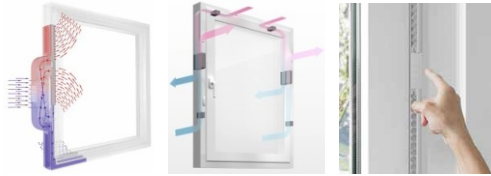
Figure 2. Schematic representation of the ventilation system

the difference ambient temperature and room temperature. Thanks to integrated sensors that measure moisture and carbon dioxide content in the air, this window decides independently when and with what intensity it will apply its ventilation system. Another intelligent addition is an alarm system window designed to alert the burglar and before the potential use of force by automatic shutter rolling or by calling for help.