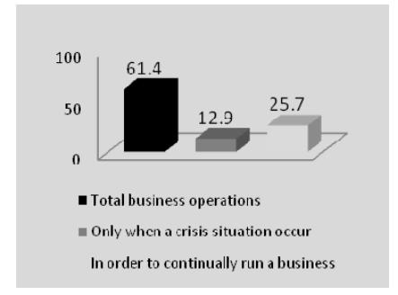
Figure 2. Controlling in different situations

It is obvious that 61.4% of the companies tested, consider the controlling function needed in total business operations, 12.9% consider that it is needed only in crisis situations, while 25.7% believe that the controlling is necessary for running a business continually. It follows that fully 87.1% of the companies surveyed, consider the need for the controlling function more than obvious. Thus, the starting hypothesis is confirmed, and there is a high level of management awareness about the significance of the controlling function for ensuring business continuity.